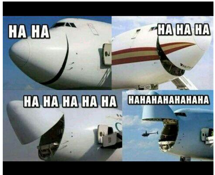
Never lose your sense of humour!