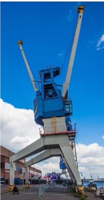
When you are happy to be a crane.